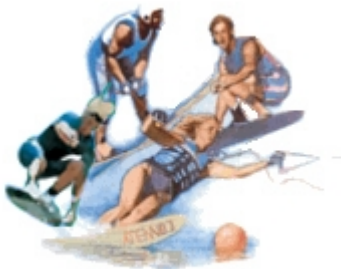
The Spirit of Water Skiing

A Guide to Understanding and Addressing Environmental Issues A Guide to Understanding and Addressing Environmental Issues